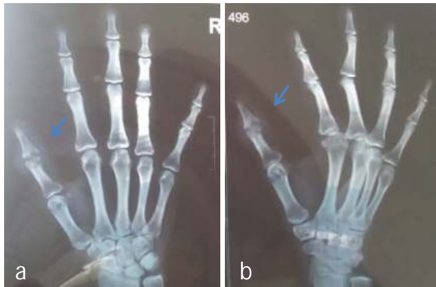
Fig. 1: Bony Irregularity in the Lower End of Distal Phalanx with Increased Joint Space and Soft Tissue Swelling A) Anteroposterior View B) Lateral View